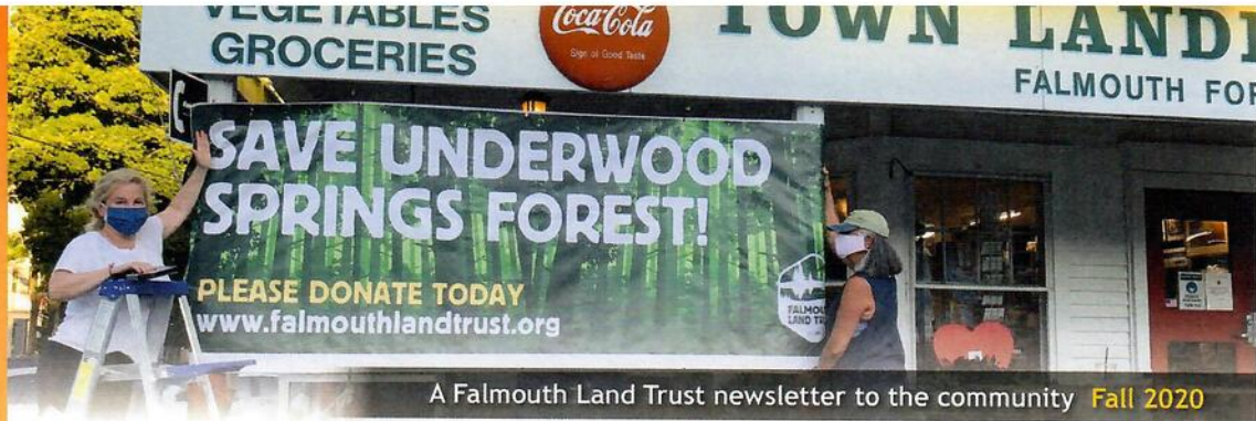
A Falmouth Land Trust newsletter to the community Fall 2020